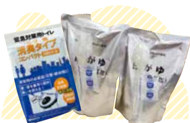
Emergency toilets (left) and rice porridge (right) will be provided as gifts

Other Information Shinjuku City, companies and other organizations will set up booths. Participating companies will also distribute gifts. Note: The number of gifts will be limited.