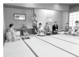
Wearing kimono and experiencing a tea ceremony

Members of the youth group from Shinjuku that visited Mitte last year accompanied the group during their visit. In spite of various language and cultural differences, the young people were able to understand each other and deepen friendly ties. We hope that young people like these serve as a bridge of friendly exchange between our two cities.