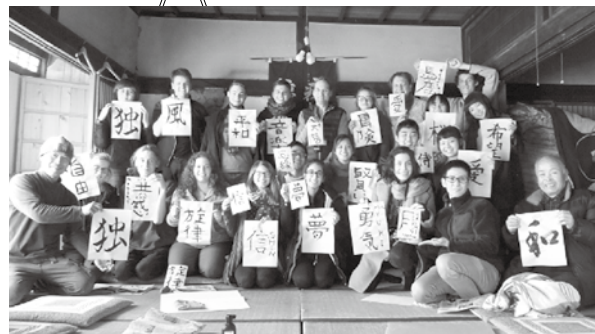
Staying in the countryside

From March 22 through April 1, a youth group of twelve people from the Mitte District—Shinjuku City's friendship city in Berlin—came to Japan. They experienced life in the countryside of Yatsugatake and also stayed with families in Shinjuku City. In addition, they learned about disaster prevention at Disaster Prevention Hall and experienced various aspects of Japanese culture, such as wearing kimono and participating in a tea ceremony.