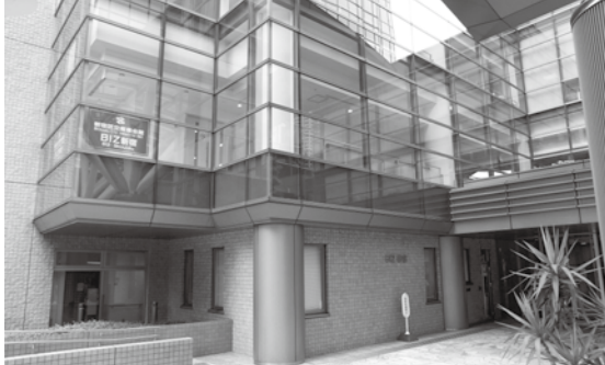
▲Municipal Industrial Hall (BIZ Shinjuku) 3F

http://www.city.shinjuku.lg.jp/foreign/english/