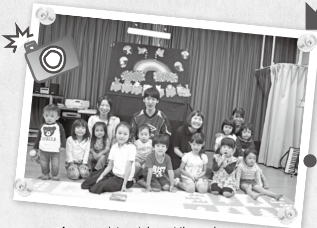
③ A group picture taken at the end. "That was fun!" "I want to come again!"