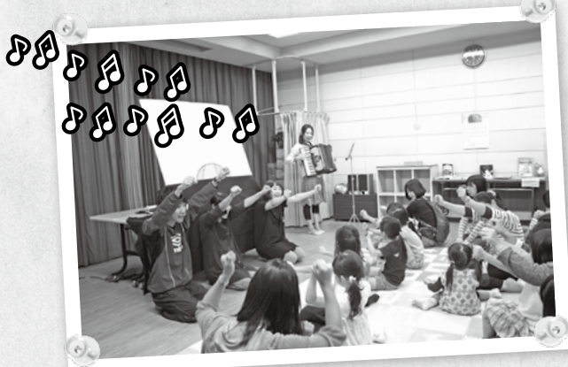
① Singing out loud in English! Let's have fun singing "If you're happy~!"

In this issue we will recap the "Storytelling in English" event held on September 28 at Kita-Shinjuku Library. There were 37 participants, and they clearly enjoyed the panel theater show—which uses a series of pictures to help tell the story—and singing together in English. Some children acted shy at first, but they were drawn in by the pictures and words that appeared on the panels, and as they sang in English together they gradually grew louder and louder, making the event lively and fun.