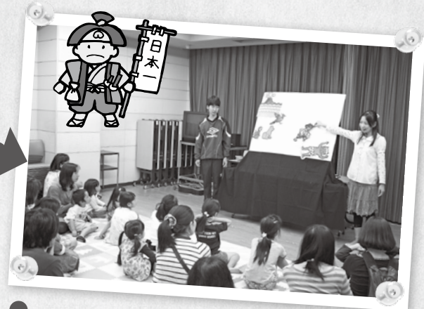
② Momotaro panel theater story in English. Familiar fairy tales feel brand-new when told in English.