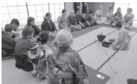
Learning about the tea ceremony while sitting on the floor Japanese style.

At the beginning, all of the participants sat on the floor Japanese style in a circle and learned the way of the tea ceremony. Later they drank Japanese tea and ate some sweets. Since the youths were unaccustomed to the Japanese language, a simultaneous interpreter interpreted what was said into German using a microphone, and the youths listened through earphones.