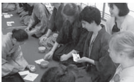
Listening carefully to the explanation.