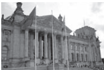
Reichstag building (German parliament conference hall)

Mitte means "center" or "middle" in German, and this district is located in the center of Berlin. In 1992, Shinjuku City signed a friendship-city agreement with the district, which was called Tiergarten at the time, and the friendly ties have existed ever since. In 2001, Tiergarten merged with two other neighboring districts to form Mitte. Shinjuku and Mitte have many characteristics in common, such as being in the center of the capital, having many foreign residents, and being rich in natural greenery.