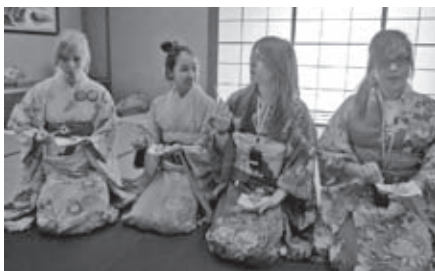
The visitors eating Japanese confections using small wooden spears.