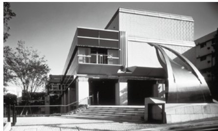
An overview of the museum

This museum displays reference materials related to local history and culture, mainly of Shinjuku City. There is a room housing a permanent exhibition and a special exhibition room where you can learn about Shinjuku City's history. The special exhibition room spotlights themes not covered in the permanent exhibit. Special exhibitions are held two or three times a year.