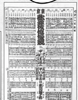
A few mitate banzuke