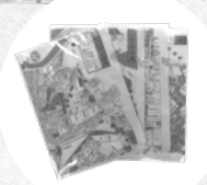
Clear files, ¥300 each

The museum shop offers a wide selection of goods—including museum publications and pictorial records of exhibitions—as well as original items such as postcards and tote bags.